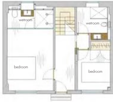
ground floor - as built