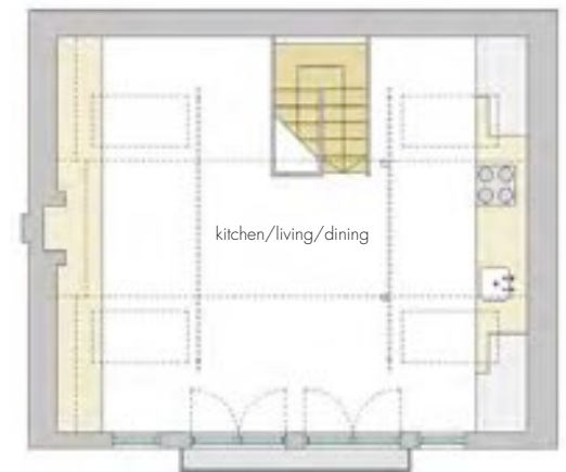
first floor - as built