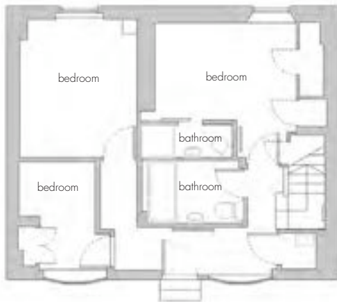
ground floor - before

A maze of small and dark rooms on the ground floor of the mews house was opened up to create two bright bedrooms and bathrooms. The main bedroom has an en-suite bathroom with a large walk-in shower separated with a glazed screen. The new oak flooring links the spaces visually and allows them to flow into each other. A new folded steel plate stair leads up to the open plan kitchen/living/dining space on the first floor. New glazed doors open up and connect the space with the outside in the summer, and the new galvanised steel balcony hinges open to allow furniture to be moved in and out. New built-in furniture and kitchen keeps the room uncluttered and maximises the feeling of space.